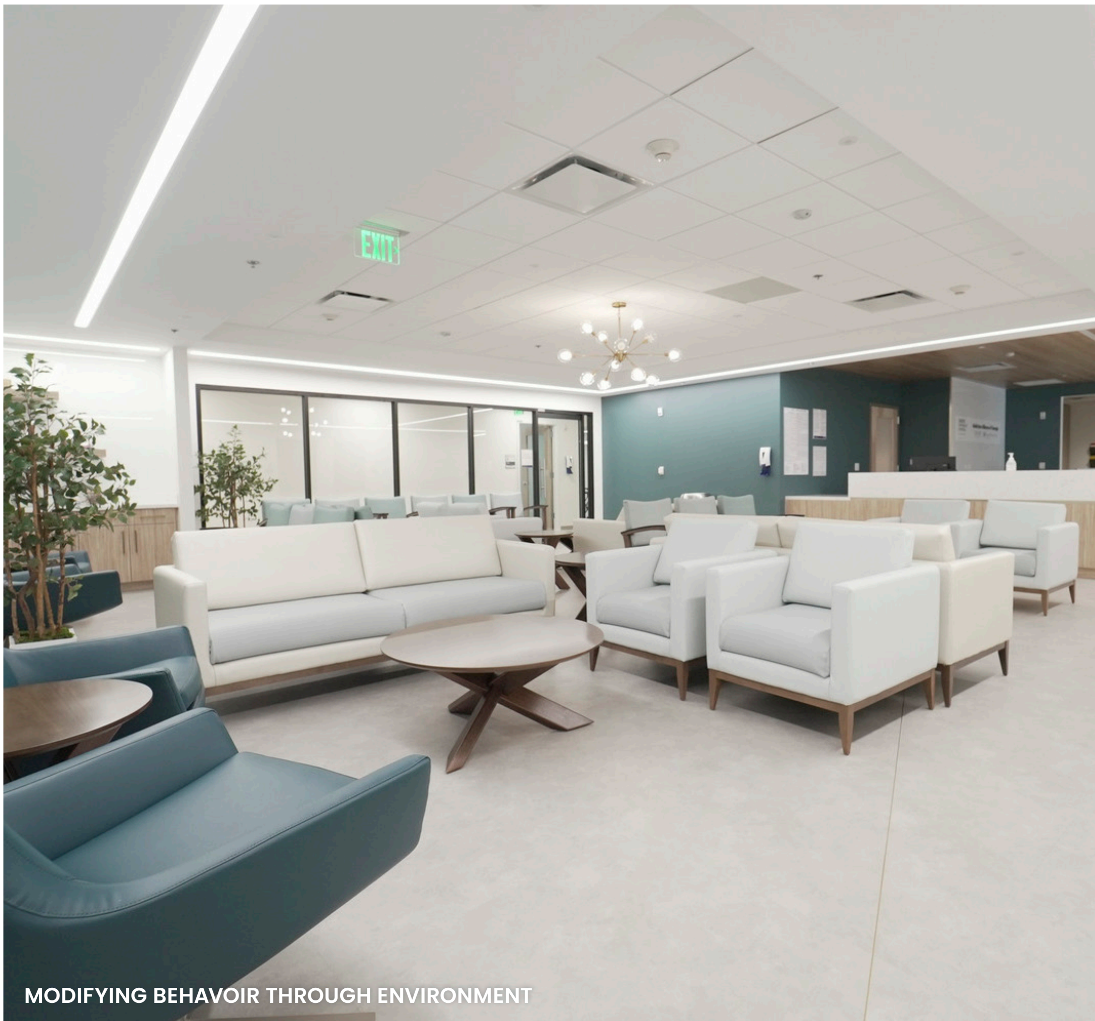
MODIFYING BEHAVIOUR THROUGH ENVIRONMENT