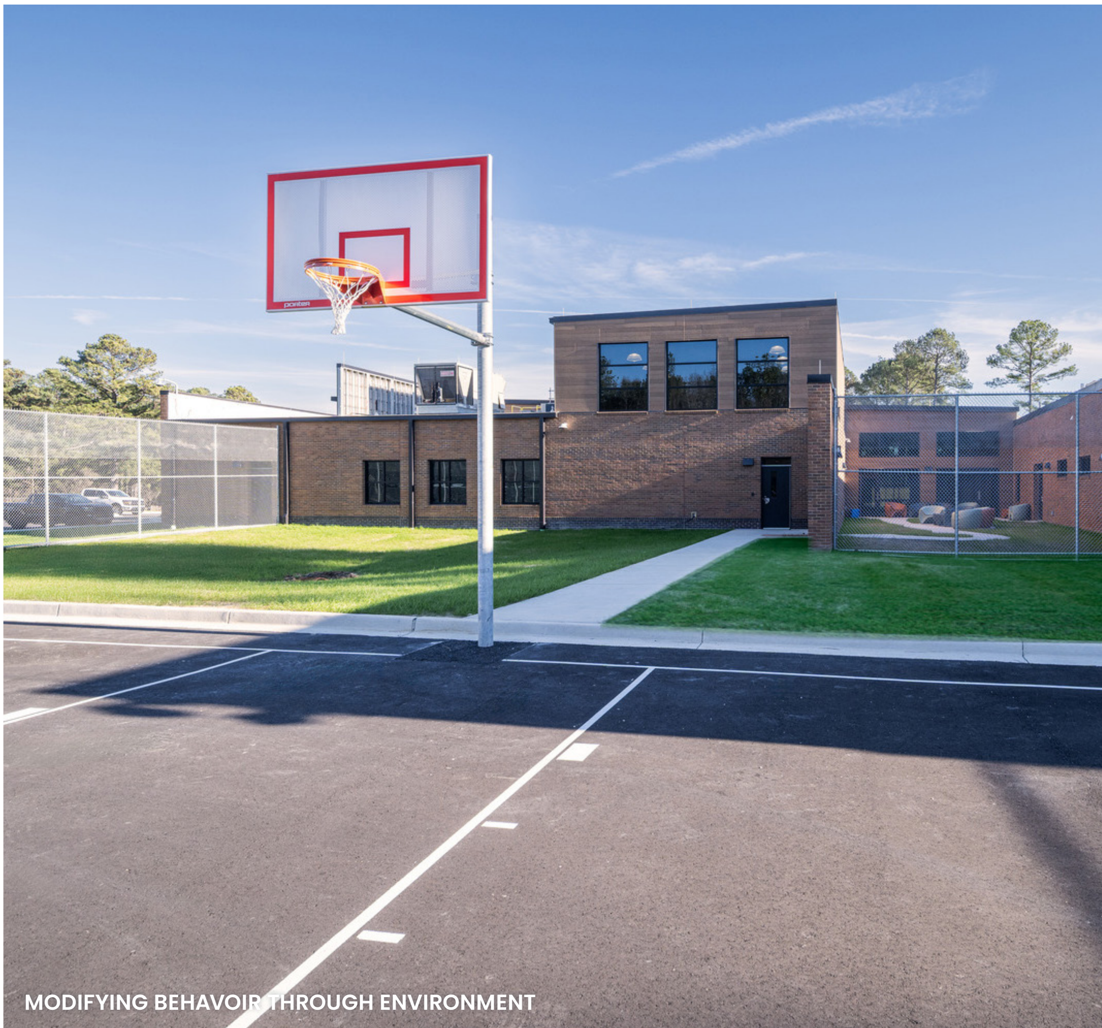
MODIFYING BEHAVIOUR THROUGH ENVIRONMENT