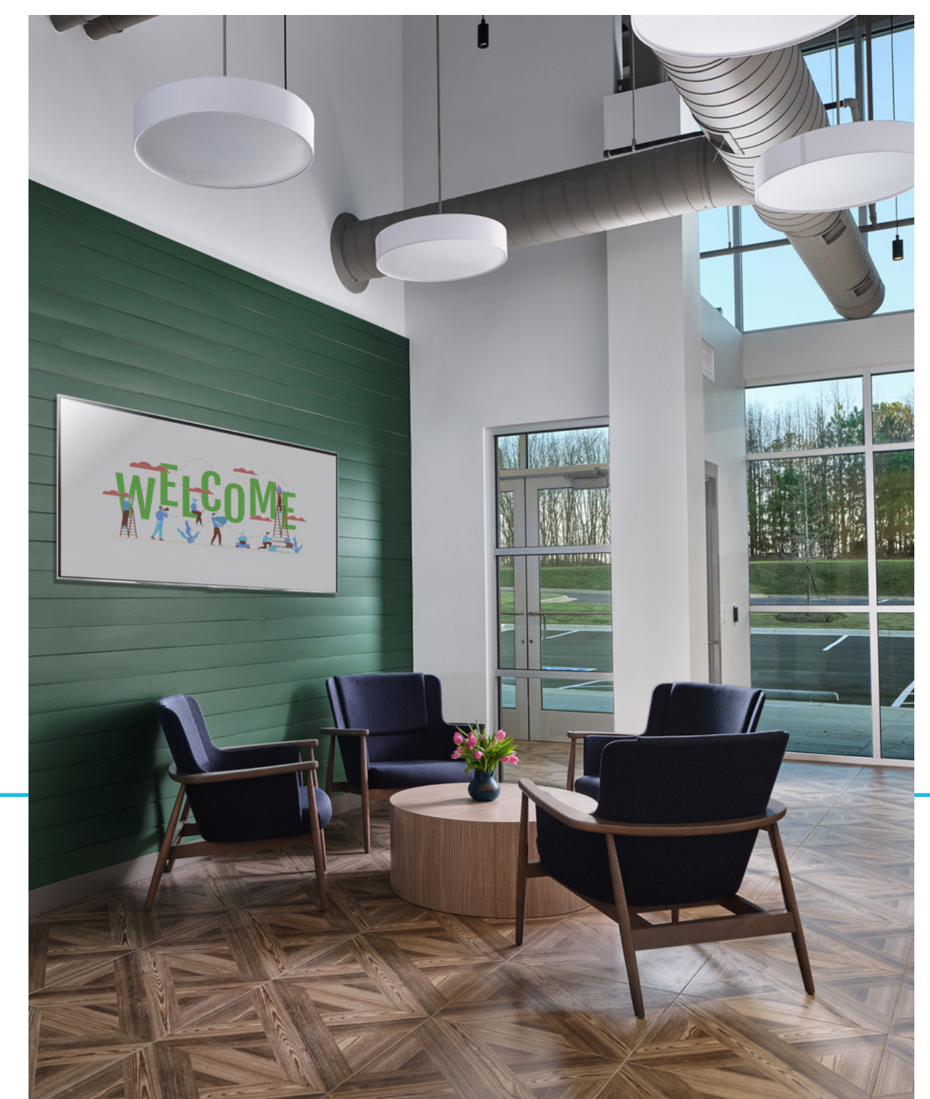
Center for Sexually Exploited Children | Gwinnett County GA