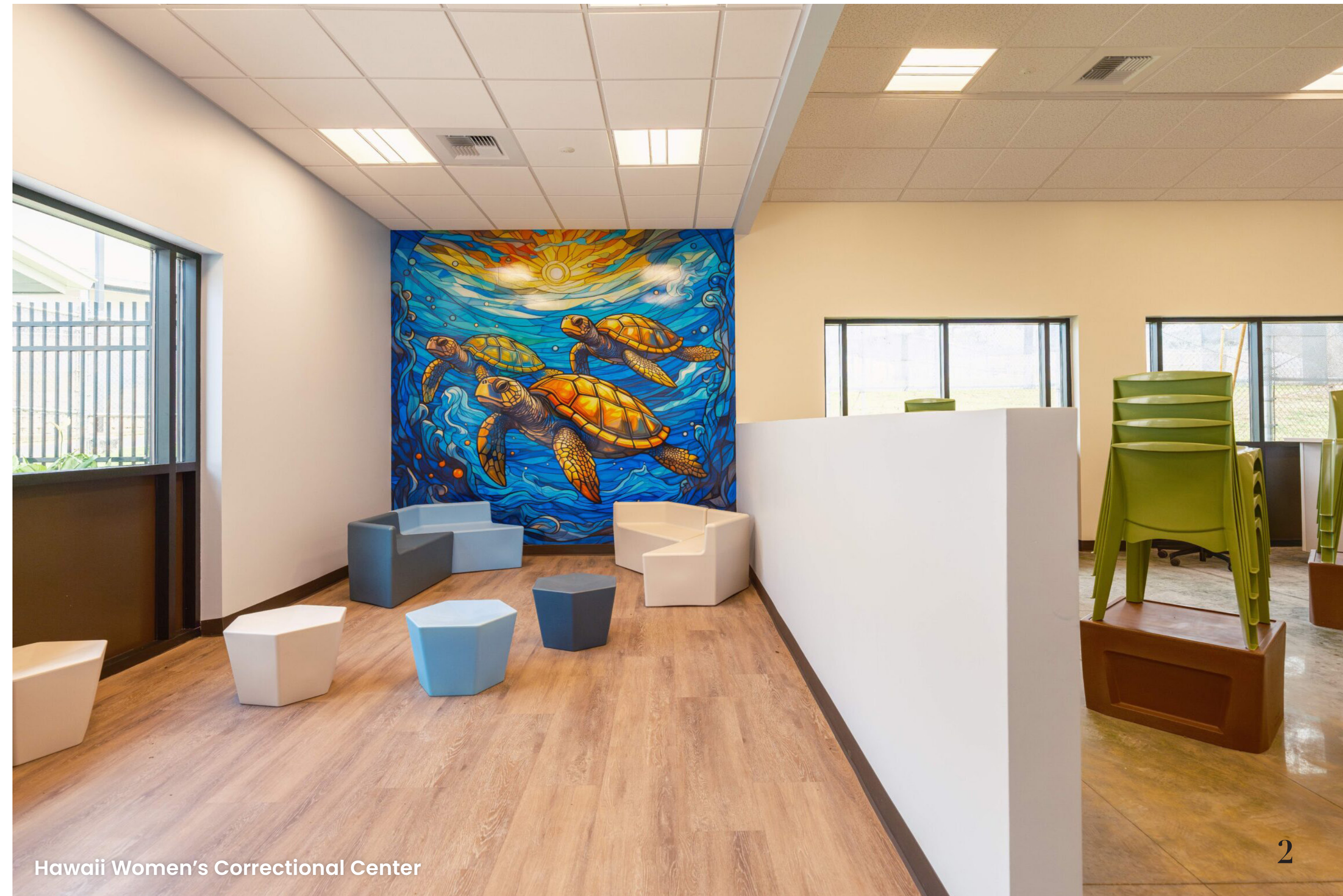
Hawaii Women's Correctional Center

At NELSON, we believe evidence-based design helps healthcare systems move beyond institutional minimums to deliver lasting value—creating secure, empathetic environments that empower staff and patients while building resilient communities.