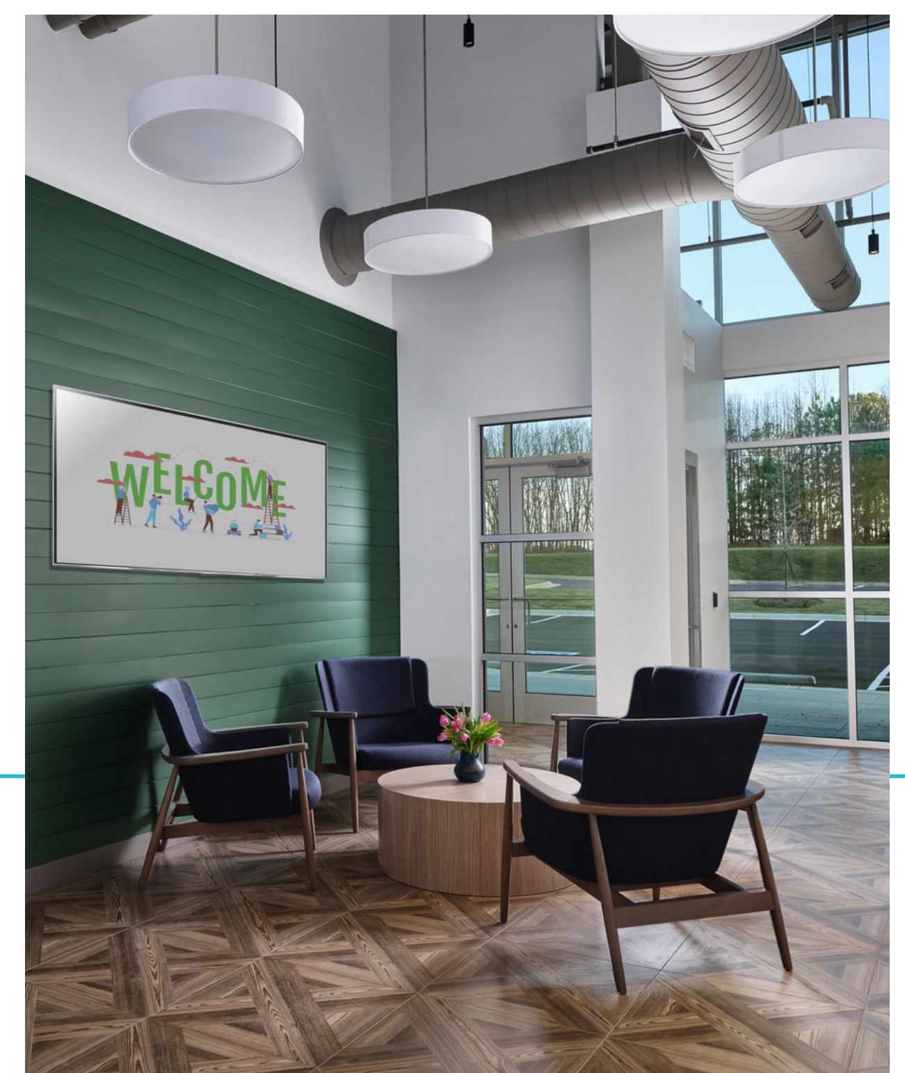
Center for Sexually Exploited Children | Gwinnett County GA