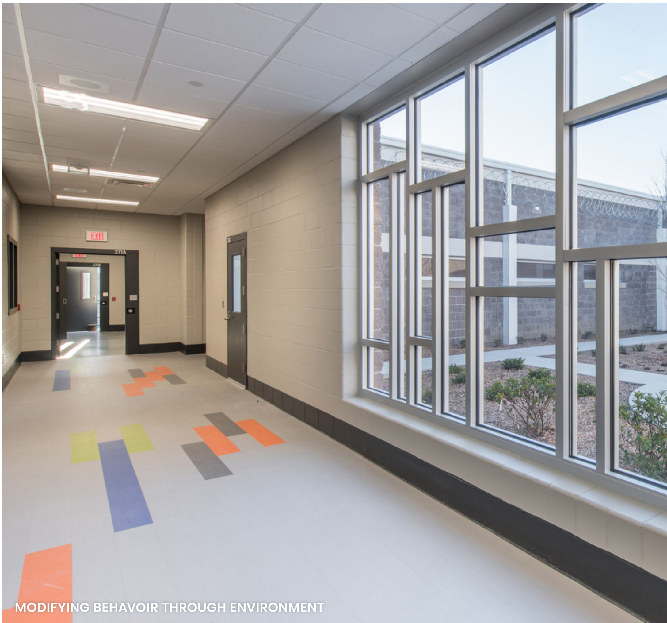
MODIFYING BEHAVIOUR THROUGH ENVIRONMENT