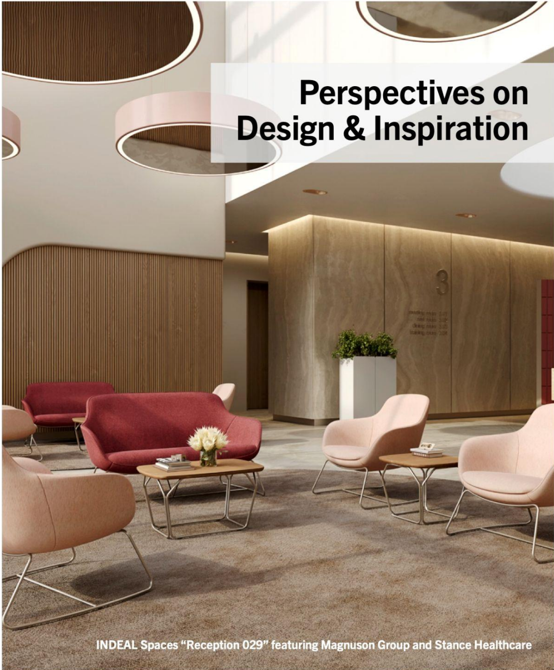
INDEAL Spaces "Reception 029" featuring Magnuson Group and Stance Healthcare